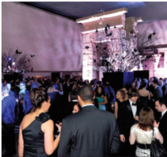
Revels to hush in the glow of the Temple of Demeter.